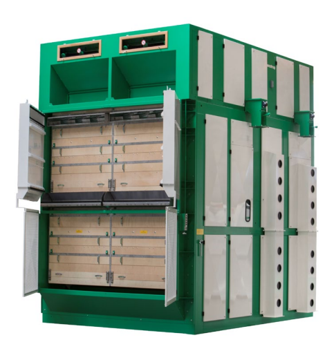
E50 with double flow set-up