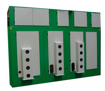
E62 with double flow set-up