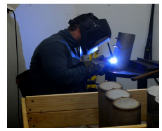
Our machines are build to last for 20 years.